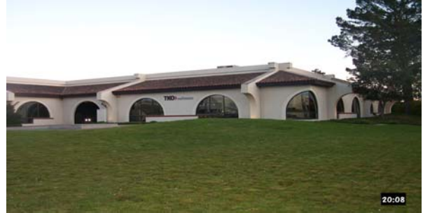
2161 Delaware Avenue, Suite C – Santa Cruz New home of Financial Resource Associates, Inc.