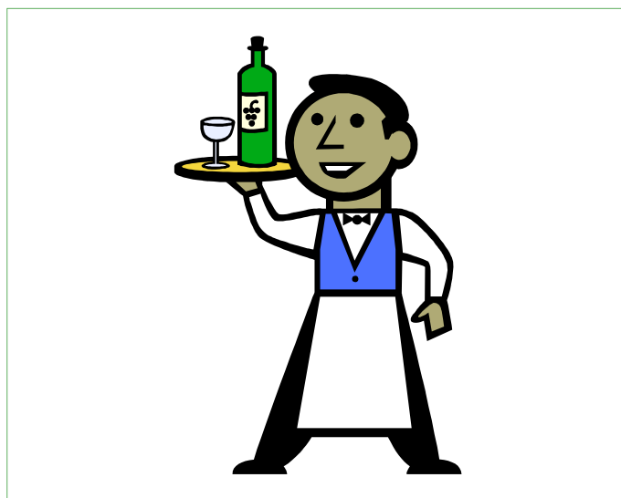
Our March 2007 Dine Around with our Advisory Council

In June we will once again be sponsoring the Chamber of Commerce Mixer at our new office location. As we did last year, we will also have the Singing Marimba band for entertainment. All our clients will be receiving vouchers for free admission which will include a marvelously catered affair, wine, soft drinks and entertainment! We hope you'll all be able to join us! We hope it's comforting to